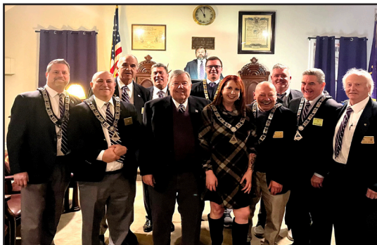
PER Dinner February 18, 2025