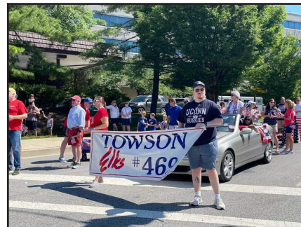
Fourth of July Parade